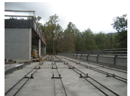
Pavimento redondos de acero y gravas

RCR Arquitectes. Equipamiento pista de atletismo Tussols-Basil